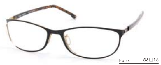
ES-6089 No.91P burgundy/gray

It's light frame gives a stress free feel. Finished with a modern art like coloring at a size that's just right.