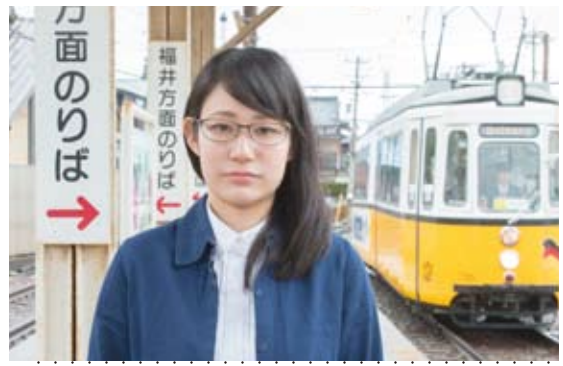
ES-6059 No.18 khaki gray/green

A hinge-less sculpted frame made of one sheet of titanium without any screws or parts welded together. In addition, with a new coloring method, the color stays on the frame longer.